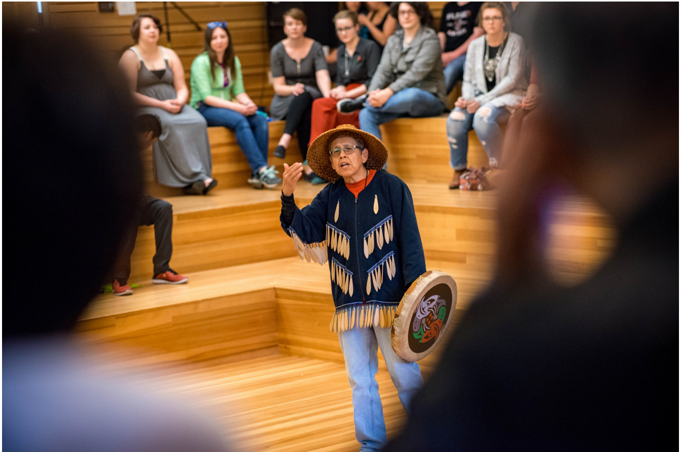
Fig 3.1: Indigenous Graduate Reception