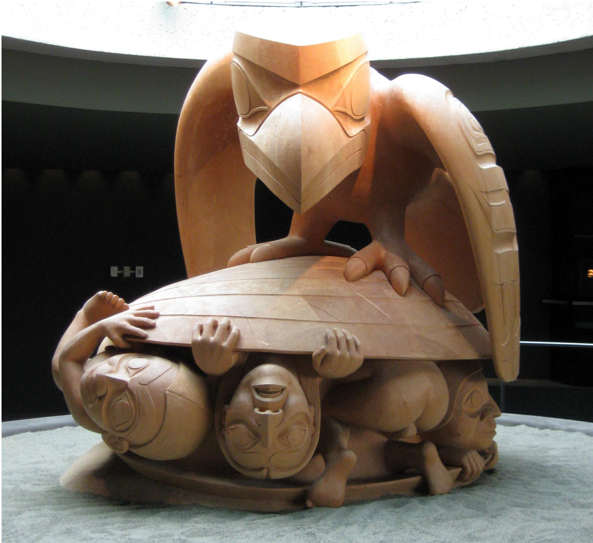
Fig 1.1 “Raven and the First Men” by Bill Reid ( https://www.billreidgallery.ca/pages/about-bill-reid ), Museum of Anthropology, UBC, Vancouver, British Columbia