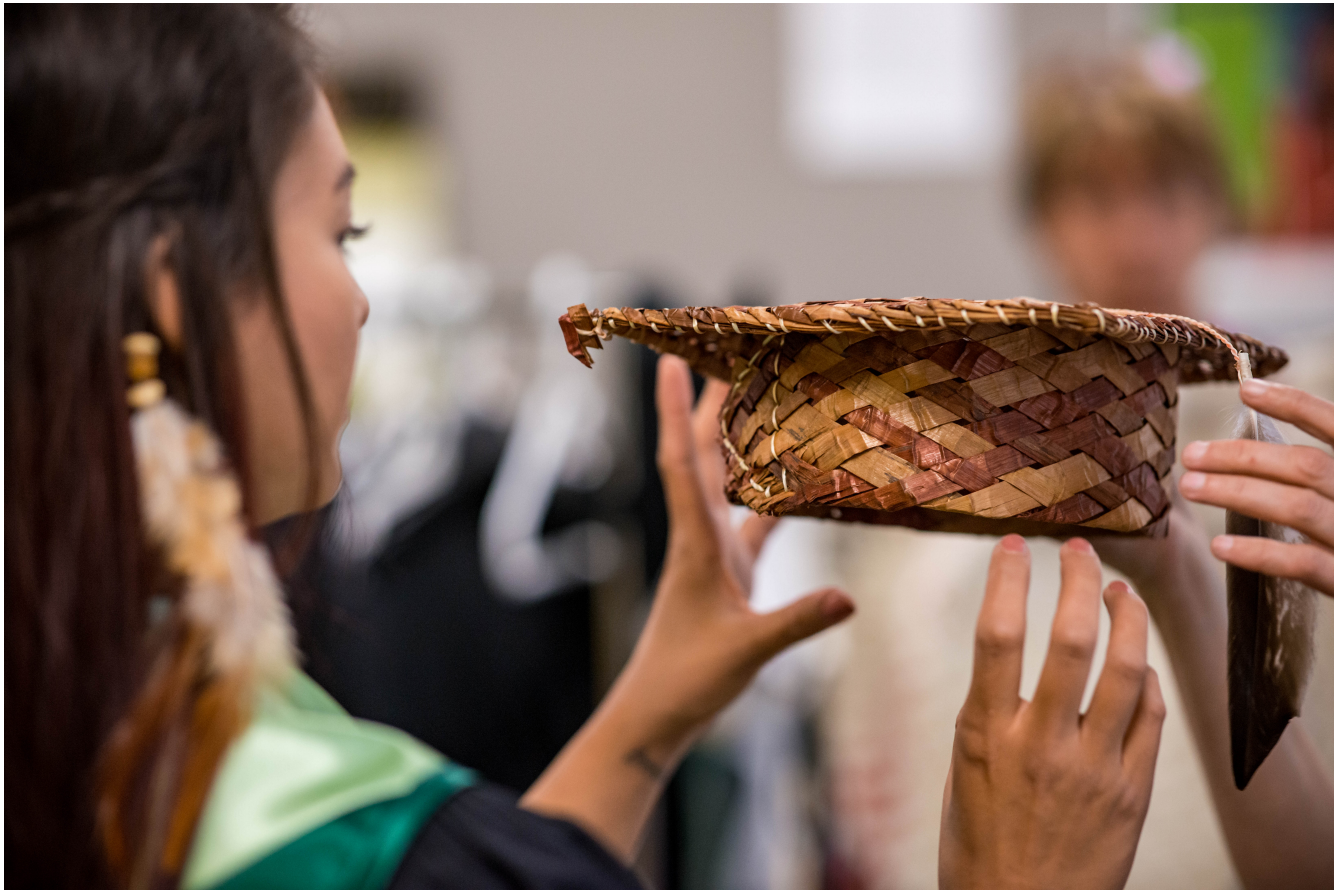
Fig 5.1: UFV Indigenous Graduate Reception 2017