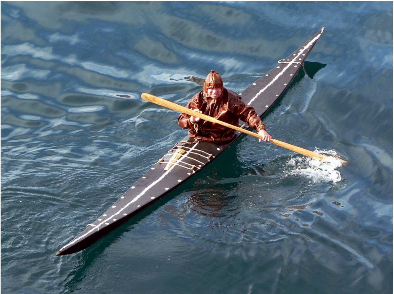
Fig 4.1: Inuit Kayaker