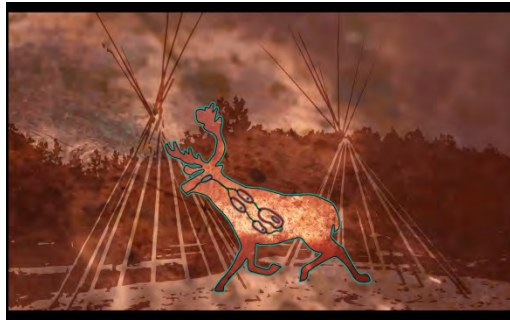
Screenshot from closing cut scene

core mechanic emphasizes balance and the design reflects the inevitability that thunderbird stories convey. The thunderbird continues to fly with ongoing scrolling environments, regardless of the player's input. And, in fact, the snake boss in the final level will eventually deconstruct on its own and darken the water with oil if the player chooses only to watch and not fight. The levels in the game exist not in relation to us, the players, but rather in relation to the truth of stories.