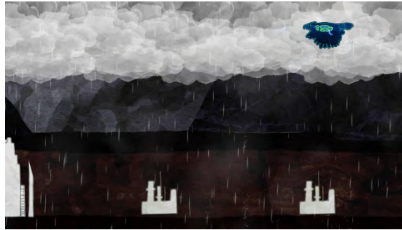
Screenshot from Tar Sands Level

extraction? Were they abstract or literal? In other words, what were the stories being offered through those games?