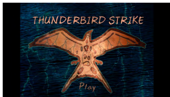
Opening Screen of Thunderbird Strike

specific places—the Tar Sands, the Prairies, and the Great Lakes—as well as specific infrastructures, but I was hoping you could elaborate a bit more on what inspired you to focus on these specific places and how, as a result, your game is situated very much in this tradition of resistance, a tradition Michi Saagiig Nishnaabeg scholar Leanne Betasamosake Simpson understands as “radical resurgence.” 1 In other words, what events and contexts inspired you to create the game and where do you situate the game itself as a form of cultural production in relation to broader Indigenous-led movements against extractivism?