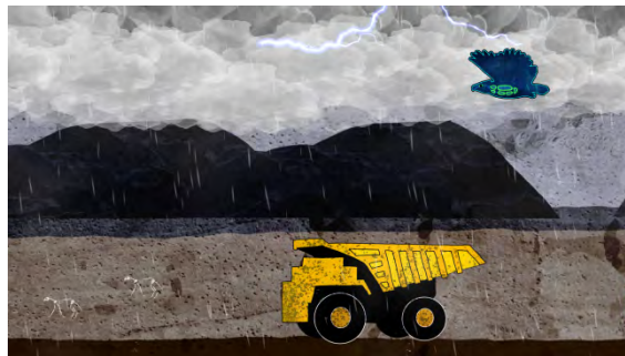
Screenshot from Tar Sands Level

JBK: In some ways, then, Thunderbird Strike can be seen as a response to the use of gaming as a means to further normalize extractivism. Can you describe the kinds of games that were developed by the game incubator to encourage